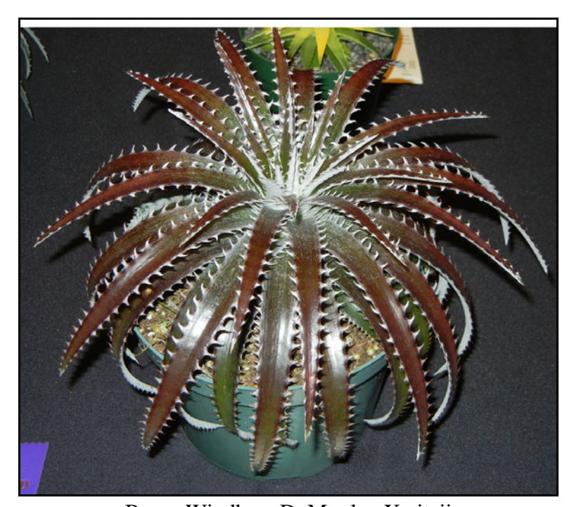
Bryan Windham D. Mar.lap X pitzii

It seems that whenever Dyckias are discussed, they are lumped with the rest of the subfamily Pitcairniodeae and given little attention. They are, however, very much different and deserve special attention. Terrestrial plants with wicked spines and tremendous root systems, they really should be grown in the ground and not in pots, as they conform poorly to potting. All (at least 90% anyhow) are indiginous to Brazil, and 100% from South America. While the bloom spikes may be susceptible to frost, the plants are extremely hardy and seem to thrive during the cold season in Florida.