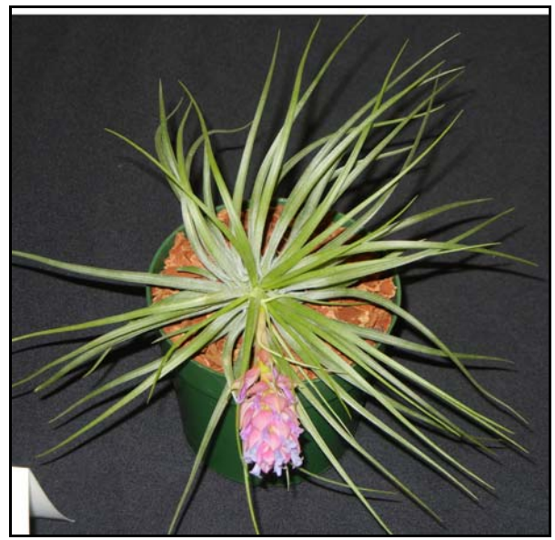
Till. Stricta Martha Burg Best of Division I Section A Single Blooming